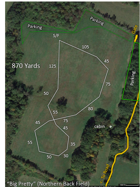
Sunday — 870 yards November 15, 2020