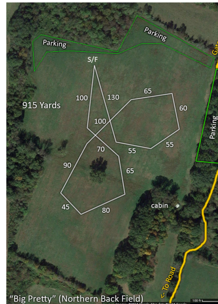
Saturday — 915 yards November 14, 2020