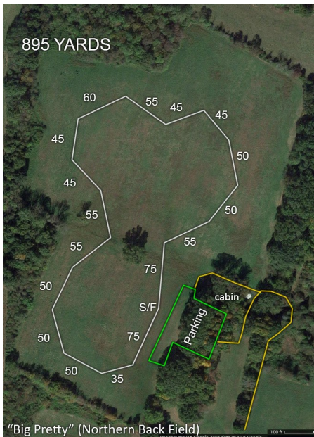
"Big Pretty" (Northern Back Field)