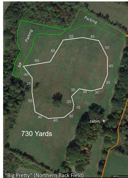
“Big Pretty” (Northern Back Field)

By Greyhound Assoc of North Georgia & Mid-Atlantic Hound Association