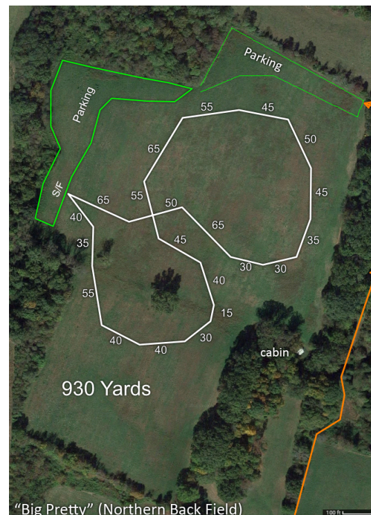
“Big Pretty” (Northern Back Field)