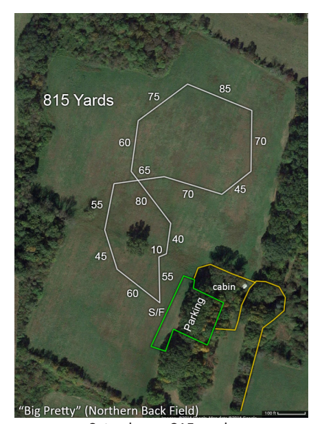
Saturday — 815 yards January 1, 2022