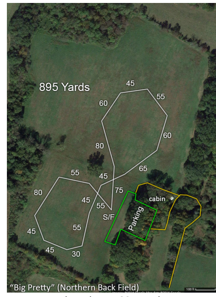
Thursday — 895 yards December 30, 2021